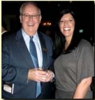
This weeks social light photos...